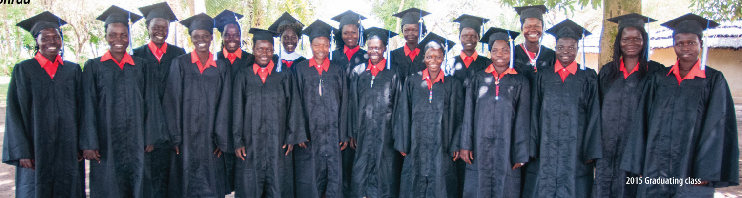
2015 Graduating class