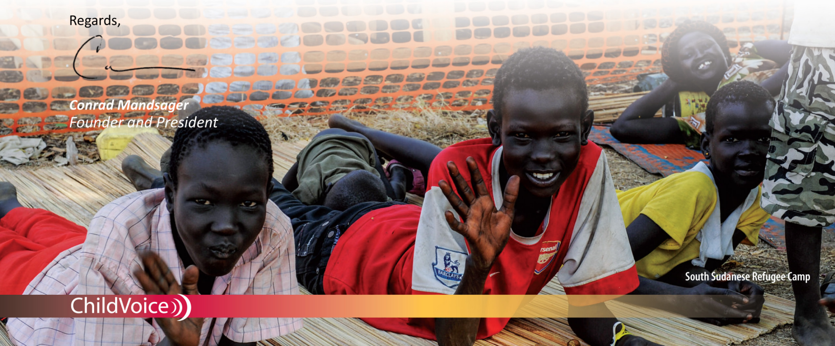
South Sudanese Refugee Camp